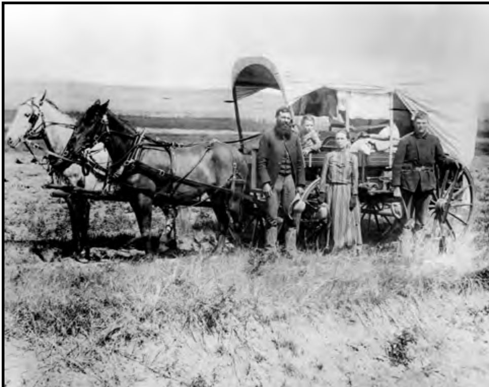
A family poses with their covered wagon in 1886 in Loup Valley, Nebraska.

The future became so real to them, so actual, so near, and so tangible in its every element that they were able to bridge the gap of the present and move out of the past into the future in the twinkling of an eye. Their daydreams and their night dreams were lived in the land beyond the horizon where everything would be what they had made it in their mental pictures. They created homes, new estates nestled in